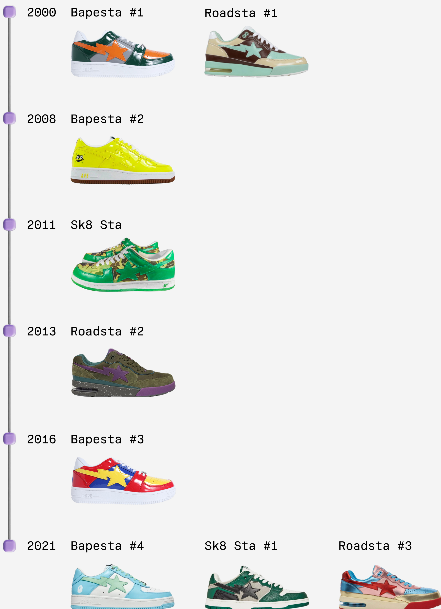
FIGURE A BAPE silhouettes, 2000–2021

Released in 2000 to much hype, the Bapesta quickly became a pop culture mainstay. With creator Nigo's departure eleven years later, the momentum of BAPE and the Bapesta slowed considerably. That changed in 2021, with the release of the Bapesta #4, Sk8 Sta #1 and Roadsta #3. FIG. A